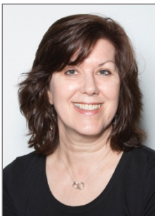
Head of Year