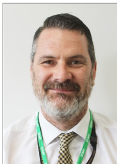
Deputy Head of Year