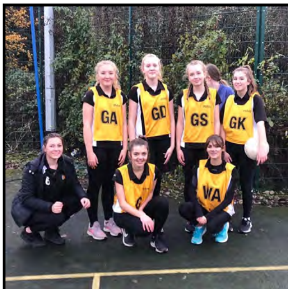
U11 Netball Team

Netball training for Years 7 & 8 is Wednesday afterschool, Year 9 + Tuesday afterschool.