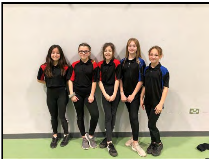
U7 Indoor Athletics Team

Most of the Year 8 team had competed in the competition last year as Year 7 so had a better understanding of the events. They again performed extremely well and only just missed out on a top two finish.