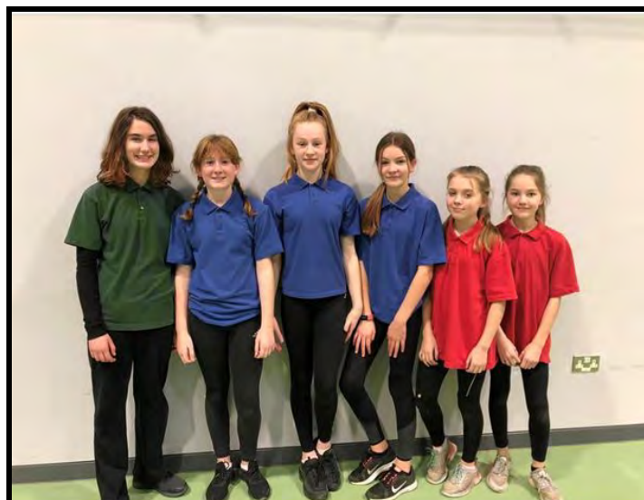
Y8 Indoor Athletics Team