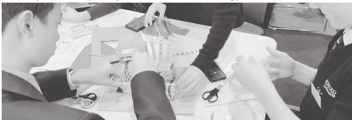
Business Language Challenge Event

A summary of partnership activity for schools in the OX14 learning partnership.