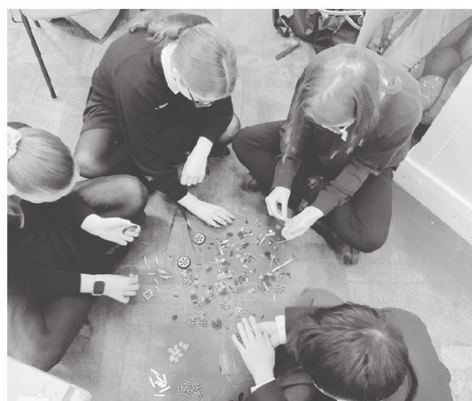
ChallengED STEM Event

Over 100 Year 8 students from across schools recently participated in ChallengED , a highly engaging, hands-on STEM Challenge Morning hosted by Larkmead School. Students worked in mixed-school teams on activities delivered by external groups; Space Store and House of Fun. Challenges focussed on developing essential skills in problem-solving, communication, and teamwork. This event provided a valuable opportunity for students to engage creatively with STEM concepts outside of the classroom, with 97% of attendees saying they would recommend the day to a friend. Students particularly enjoyed meeting new people and successfully challenging themselves throughout the morning.